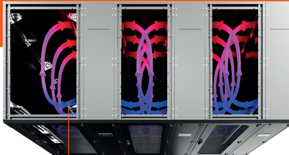
Air circulation inside the MCL